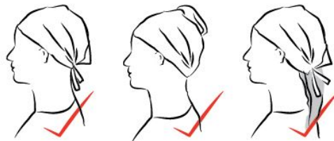
Whole head and hairline completely covered

Head coverings of any kind are useful for a meditative practice. Turbans are useful for holding energy in, and for creating a meditative focus at the third eye point (brow point). Another benefit of wearing a turban is that when you wrap the 5 to 7 layers of cloth, you cover the temples, which prevents any variance or movement in the different parts of the skull.